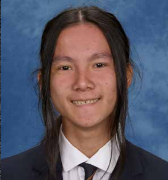
THE INTELLIGENCE Nghia Dao